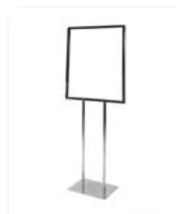
Chrome Sign Holder