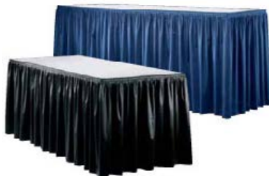
Table with Skirt

Show color will apply if no color is selected. Color availability is only guaranteed with pre-orders.