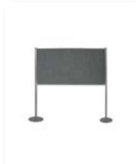
Tack Board Vert - 4' x 8' Hori - 8' x 4'