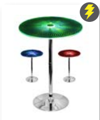
Lighted Pedestal Table (Electricity is not included)