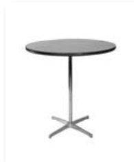
Gray Pedestal Table 30"D x 40"H (30" optional)