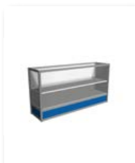
6' & 5' Display Case (6' Vert. Opt.)