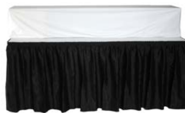
Table with Riser & Skirt

CANCELLATION POLICY: Table orders cancelled during or after show move in, including change order requests, will receive a 50% refund of original price.