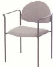
Padded Arm Chair