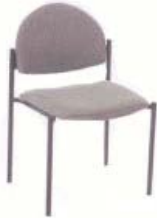
Padded Side Chair